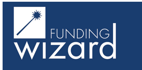
CARB FUNDING WIZARD