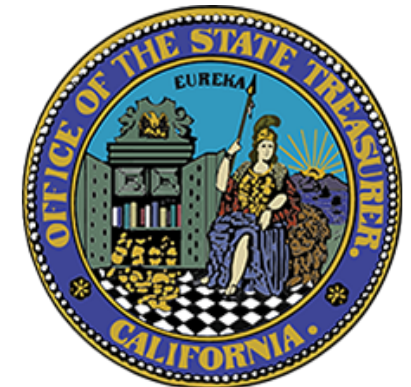
STATE TREASURER'S OFFICE PROGRAMS