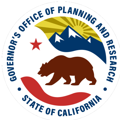
OPR WEEKLY FEDERAL GRANTS E-LIST